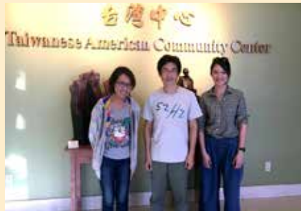
Renowned Taiwanese director Wei Te-Sheng introduced his new movie “52 Hz, I Love You” on 11/8/16