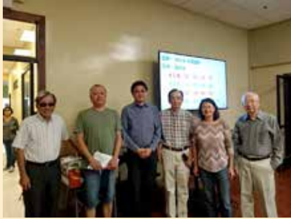
Speakers discussed “2016 California Propositions” in 10/8/2016 Life-Experience Seminar

JANUARY FEBRUARY MARCH WINTER ISSUE 2017