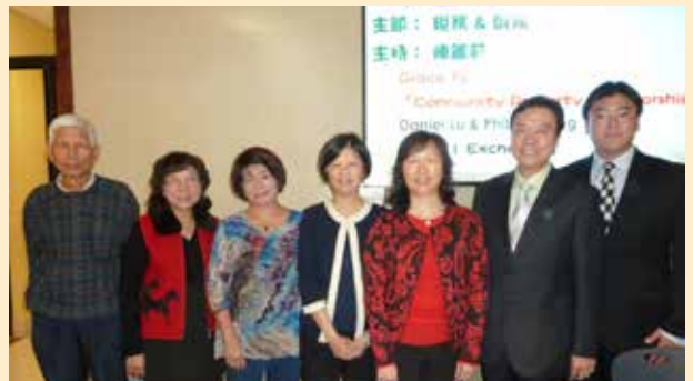
Financial specialists presented “Community Property & 1031 Exchange” in 12/10/2016 Life-Experience Seminar