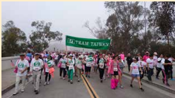
Team Taiwan at “Susan Koman Race for Cure” in Balboa Park on 11/6/2016