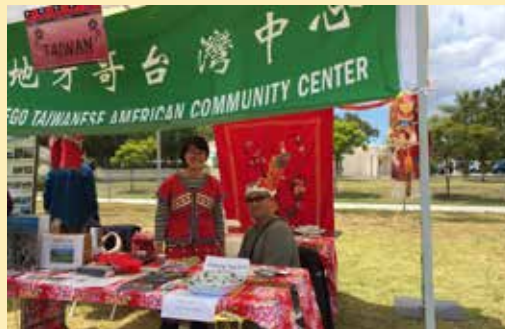
Taiwan center's booth at 5/7/16 Asian Culture Festival