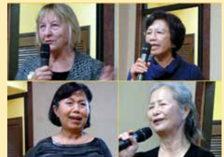
Panelists talked about dealing with aging in 4/9/16 Life-Experience Seminar