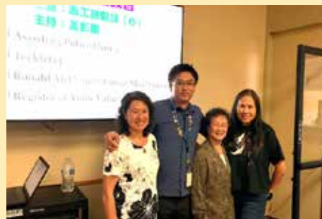
Panelists talked about their volunteer experience in 6/11/16 Life-Experience Seminar