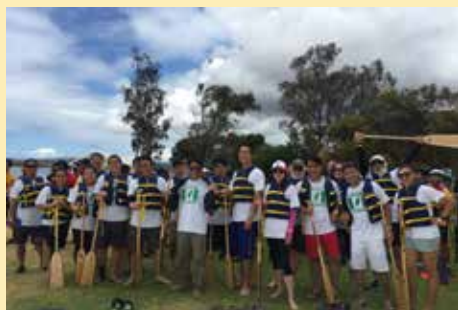
Team Taiwan participated 2016 San Diego Dragon Boats race on 5/7/16