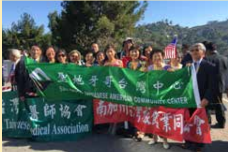
Taiwanese Americans from San Diego welcomed President Tsai Ing-Wen visiting LA on 6/30/16

JULY □ AUGUST □ SEPTEMBER □ SUMMER ISSUE 2016