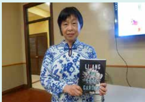
Author Li Ang introduced her book "The Lost Garden" on 1/23/16