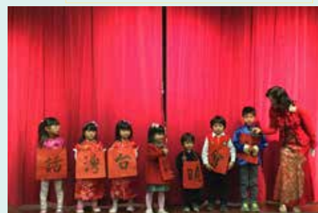
A group of kids performed Taiwanese songs at Lunar New Year party on 2/13/16