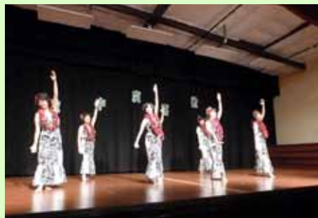
TACC Hawaii Dance Club performing at mid-autumn moon festival on 9/29/12