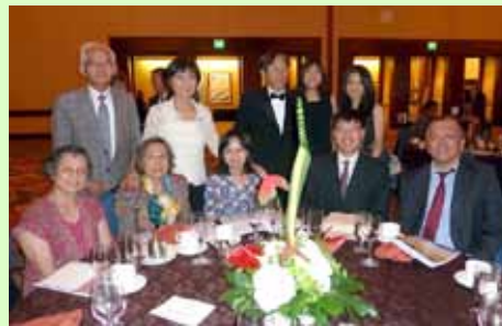
TAFSD delegates for Asian Heritage Award dinner on 9/15/12