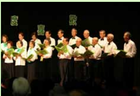
TACC Senior Choir performing at mid-autumn moon festival on 9/29/12