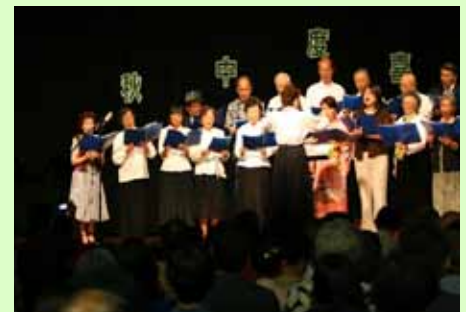
TACC Japanese Club performing at mid-autumn moon festival on 9/29/12