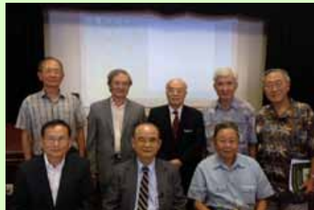
The invited speakers for "Religions and Sciences" on 9/29/12 Culture & History Lecture Series