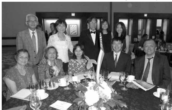
TAFSD delegates at the AHA ceremony