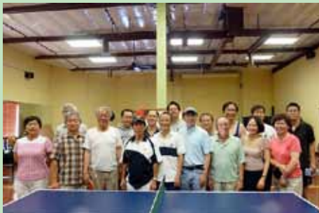
Table tennis competition at TACC