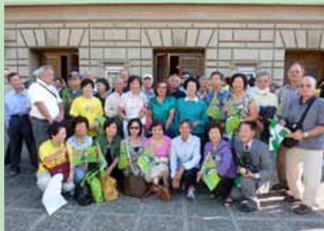
Rally for Tsai Ing-wen at Pasadena on September 19, 2011

Website: www.taiwancenter.com E-mail: taiwancenter@gmail.com