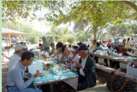
Annual TACC Senior Group picnic at Felicita Park in Escondido