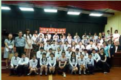
Taipei Tian Mu Junior High School choir & recorder orchestra performed at TACC

OCTOBER NOVEMBER DECEMBER FALL ISSUE 2011