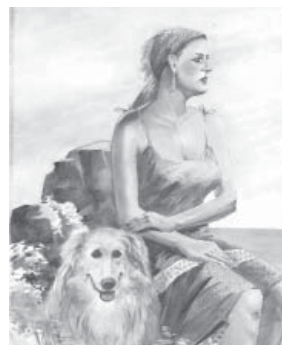
By Yuen C. Tam

This exhibition is an important event in San Diego because it is rare to have so many watercolor portraits and figures in a single show as the major theme. These three artists share the belief that the watercolor can do portraits in details equally well as the oil painting. They hope that this joint exhibition can break the myth about the limitation of painting watercolor.