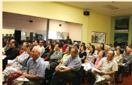
Life Experience Seminar