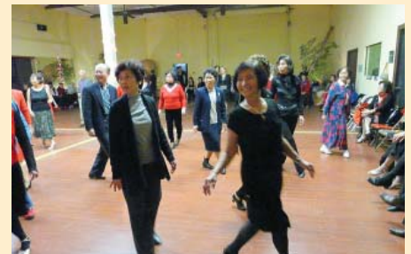
Line dance at New Year Eve's Party