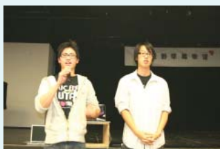
UCSD Students Support Taiwan's Wild Strawberry Student Protesters