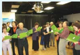
New Year Eve Party (12/31/08) Sing Auld Lang Syne