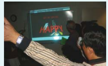
Count Down to New Year