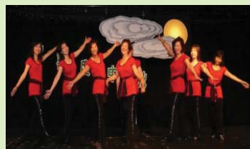
Moon Festival Performances (9/6/08) Line Dance