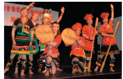
Lily Dance Group Performed Taiwanese Aboriginal Dance at the Multicultural Night